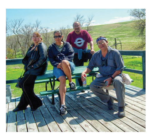
Outside of Bear Butte Lodge

The very popular and successful gardening program became the focus of our summer school, improving attendance dramatically since it started in 2006.