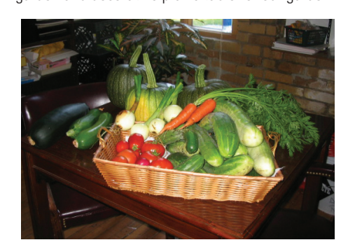
A sample from our Fall Harvest

Construction of fencing and flower boxes for our garden and decorative picnic table for our garden.