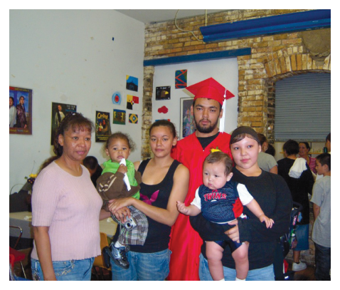
One of our 2009 Graduates and Family.

We are learning that things that nurture positive experience, like emphasizing the critical importance