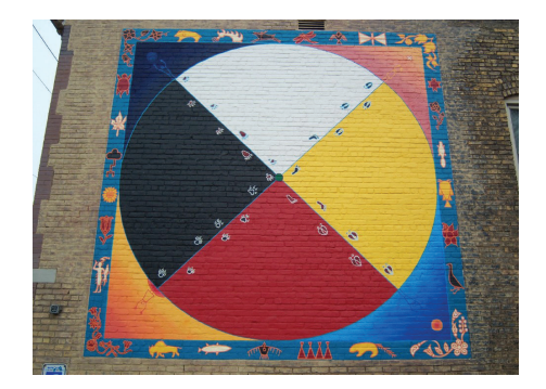
Our Garden Mural phase 2

Strengthened through a strong Native and community network, Center School continued to grow and innovate during the 2008-09 year: