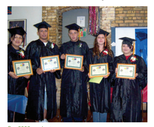
Our 2008 graduates.

Center School expanded programming and increased its commitment to an integrated culturally specific curriculum. This work resulted in marked improvements in student outcomes during the 2007-08 school year: