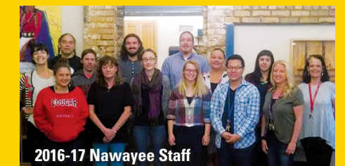
2016-17 Nawayee Staff