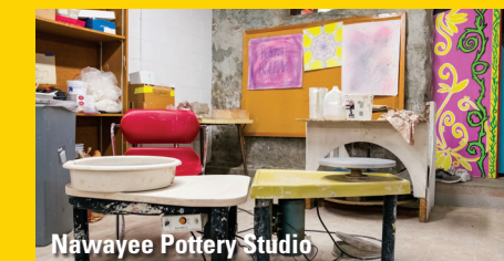
Nawayee Pottery Studio