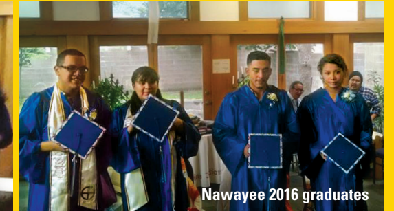
Nawayee 2016 graduates