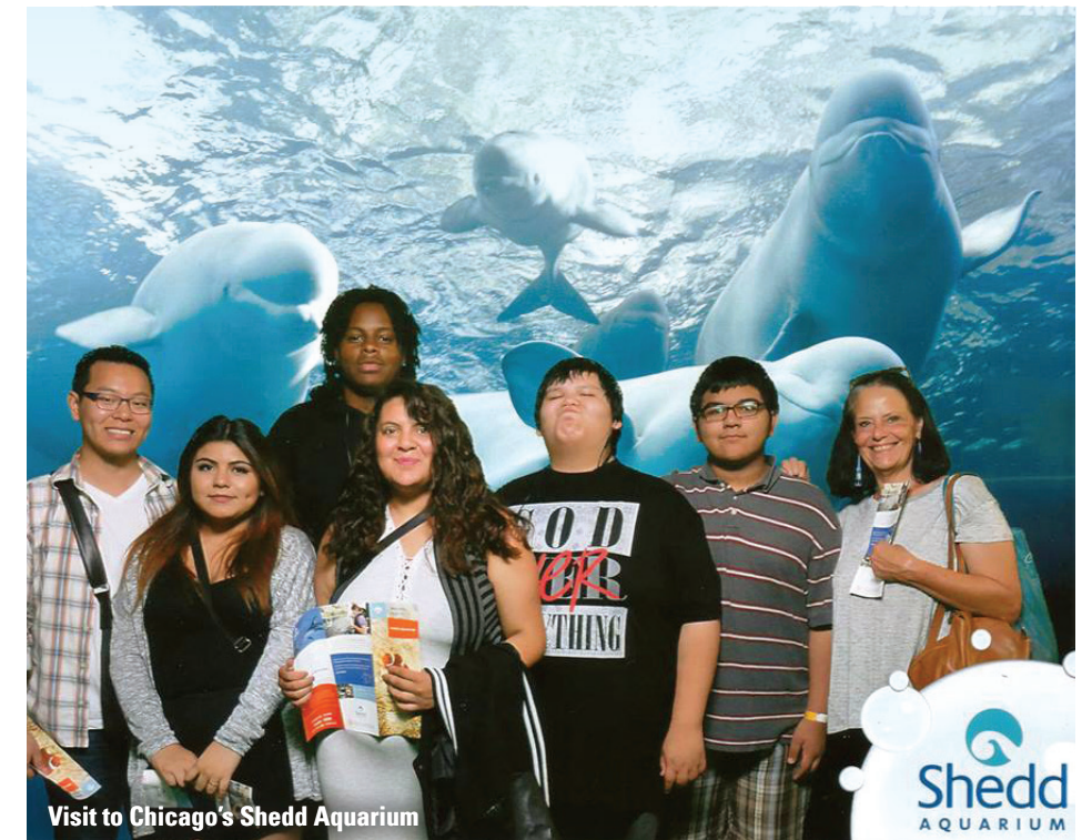
Visit to Chicago's Shedd Aquarium

He nailed it. Since the new species doesn't have any natural predators (think small pox in blankets)