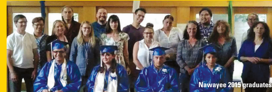
Nawayee 2015 graduates

Great things that happened during the 2015-16 school years: