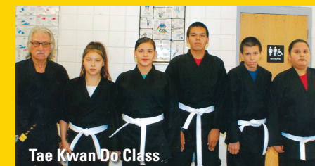
Tae Kwan Do Class

With a generous grant from the Notah Begay III Foundation we were able to purchase a salad bar for our lunch room in order to serve fresh vegetables and fruits, either purchased locally or grown in our garden.